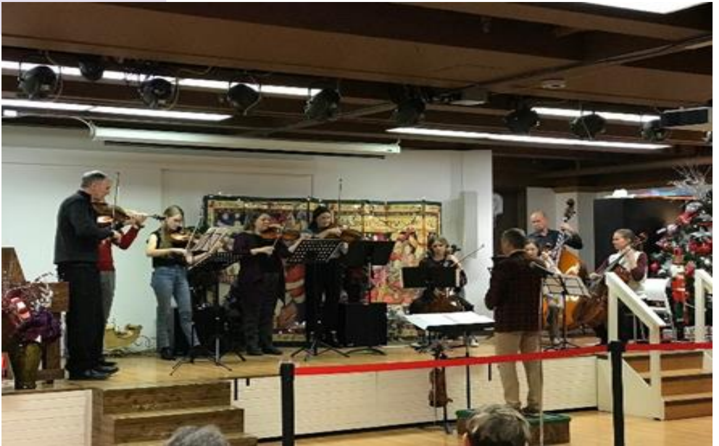
Above photos: The Foothills Philharmonic Orchestra completed our month of holiday season entertainment, by playing some classical Christmas carols.