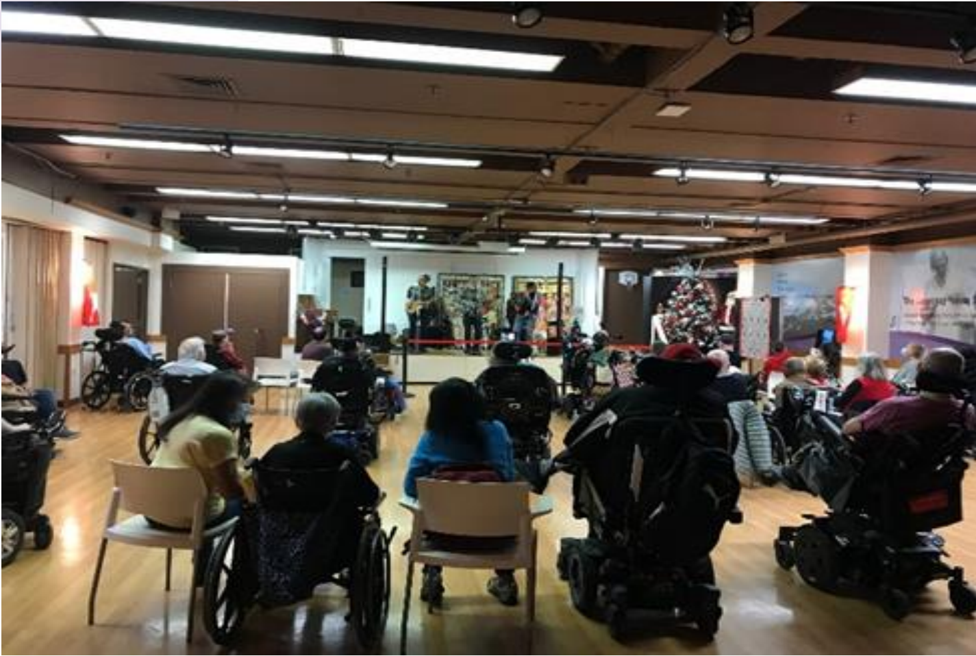
Above photos: The Coyote Creek Band played many country and Christmas favorites and kept the audience movin' and groovin'.