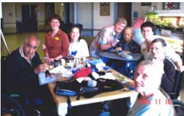
Staff and patients on Carewest Dr. Vernon Fanning's Neuro Rehab unit filled 42 pairs of socks with toiletries for the Mustard Seed.